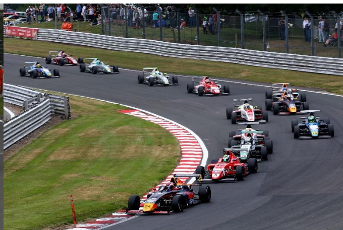
F4 British Championship