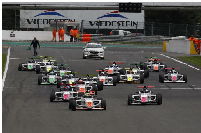
F4 French Championship