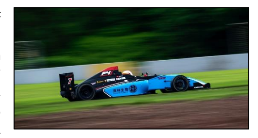
F4 Chinese Championship

From 7<sup>th</sup> to 9<sup>th</sup> April, the Mygale Formula 4 will also race on the Sandown Circuit in Australia for the launch of the 2017 F4 Australian Championship. On 22 and 23 April, the F4 Chinese Championship will begin at Zhuhai at the same time as the very first race of the Renault F4 DK, the Danish F4 Championship, on the Jyllandsringen circuit.